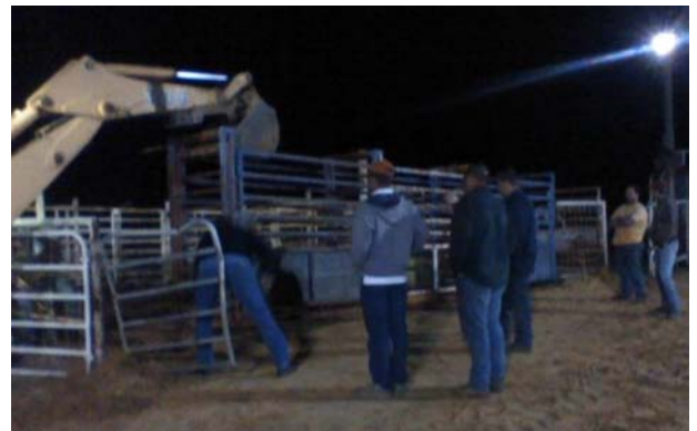
Thursday's work day was a huge success!

All members are encouraged to participate in the work day!