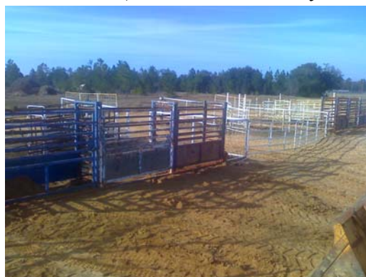
Bucking chutes are set in place!

If you want to help or if you can contribute, contact Stan or Bryan.